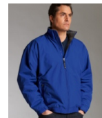
Navigator Jacket – Navy $45.75