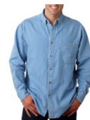
Denim LS Shirt - $22.75