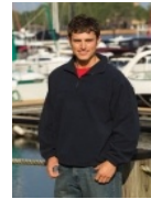
Fleece Pullover – Navy $23.75