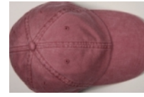
Adams Hat - Navy, Red